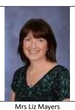
Nursery Teacher (Wednesday Thursday and Friday)