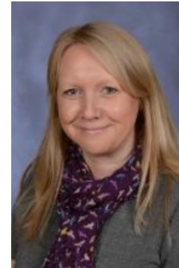
Mental Health First Aider – Safeguarding Team