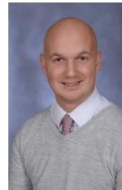
Deputy Headteacher (Deputy DSL)