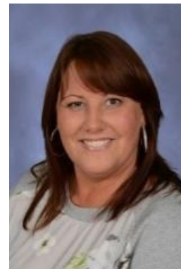
Deputy DSL – Pastoral Lead