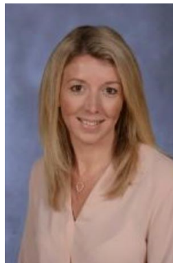
Headteacher (Designated Safeguarding Lead)

Our practice and procedures are informed and driven by the work of Warrington Safeguarding Partnership https://www.warrington.gov.uk/warrington-safeguarding-partnership and we work collaboratively within our Trust to ensure the very best practice and procedures.