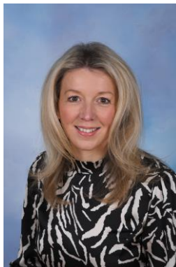
Headteacher (Designated Safeguarding Lead)

Our practice and procedures are informed and driven by the work of Warrington Safeguarding Partnership https://www.warrington.gov.uk/warrington-safeguarding-partnership and we work collaboratively within our Trust to ensure the very best practice and procedures.