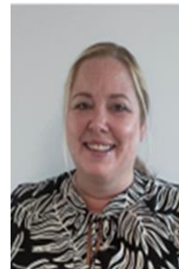
Deputy Headteacher (Deputy DSL)