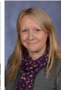
Mental Health First Aider – Safeguarding Team