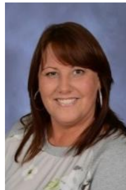
Safeguarding and Pastoral Lead (Deputy DSL)