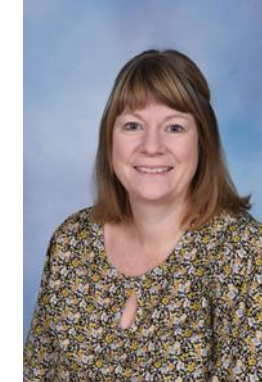
SENDco – Safeguarding Team